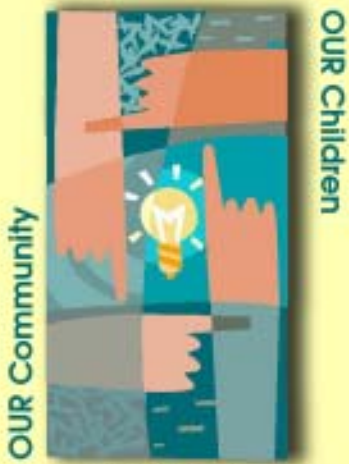
Newsletter for the Lancaster County Community Groups